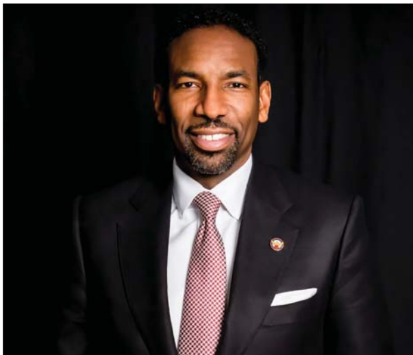
Mayor of Atlanta Andre Dickens