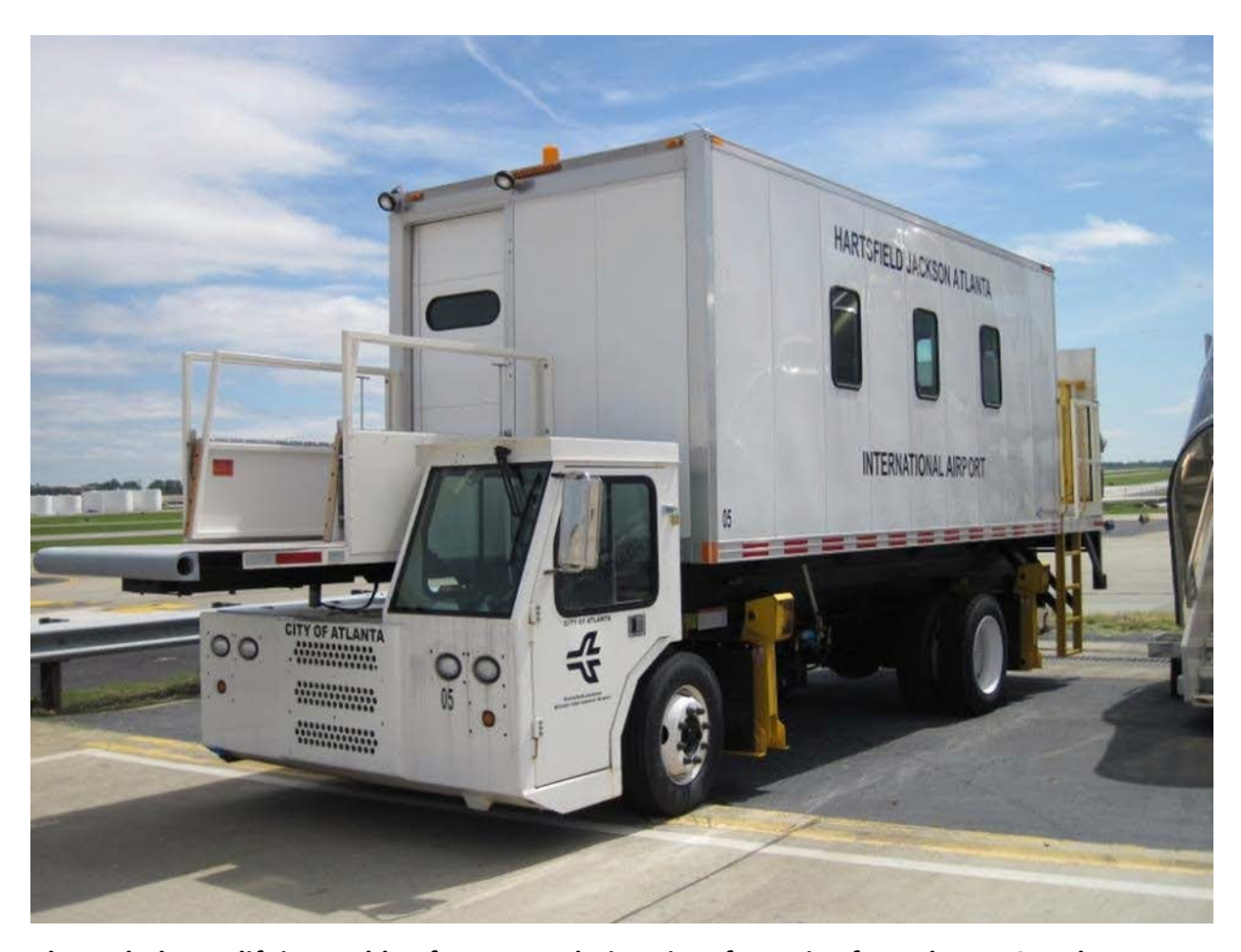
The ambulatory lift is capable of accommodating aircraft ranging from the E170 to the B747-400.