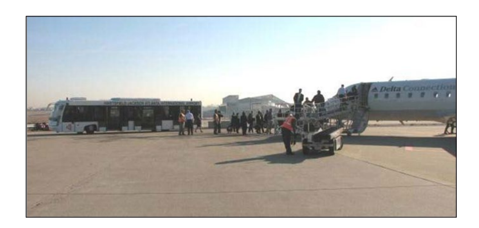
Exhibit A Hardstand Areas and Airport Equipment

Hartsfield-Jackson Atlanta International Airport (ATL) owns and operates the necessary equipment available for passenger transportation in the event of tarmac delays. There are two aircraft hardstands located on Ramp 6 South. The hardstands may be used for: