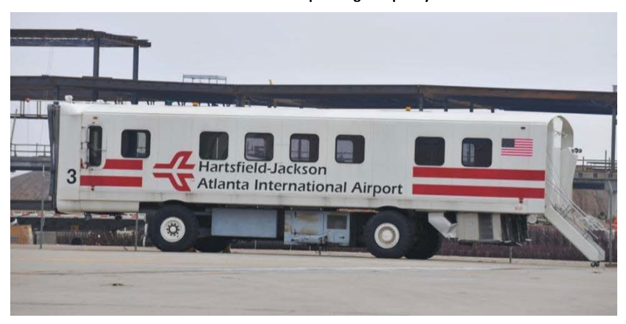
There are two PlaneMate vehicles with an 85-passenger capacity.