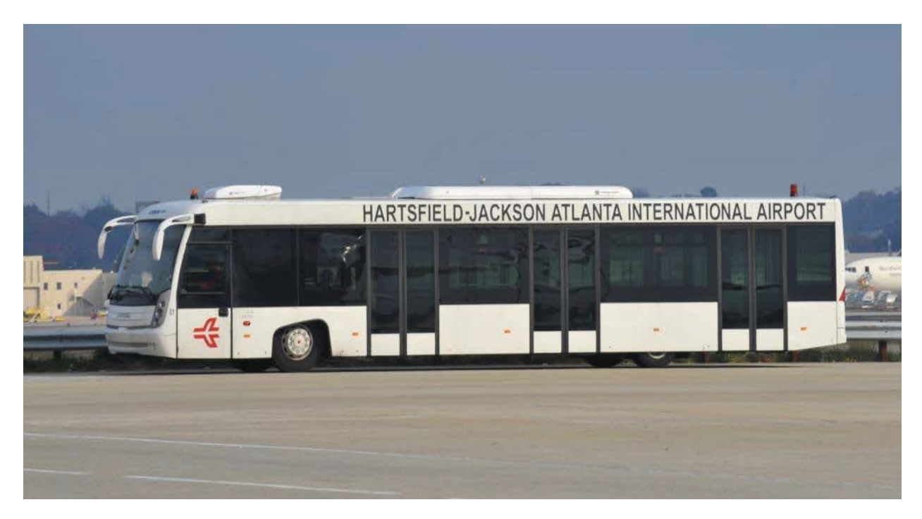
There are four COBUS 3000 vehicles with a 75-passenger capacity.