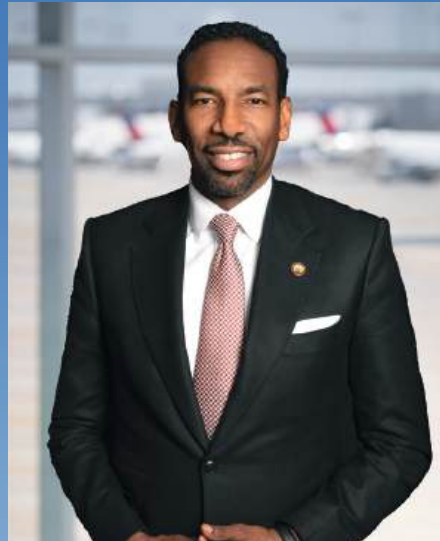
Mayor of Atlanta Andre Dickens